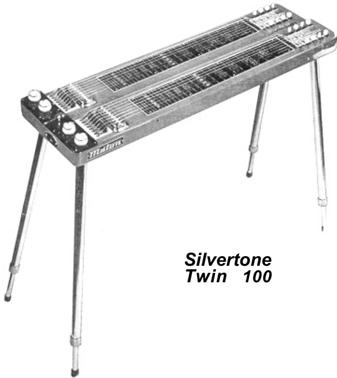
Silvertone Twin 100