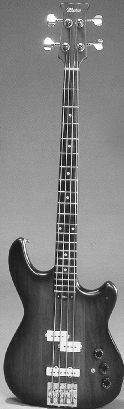
JB 4 FRETTED BASS